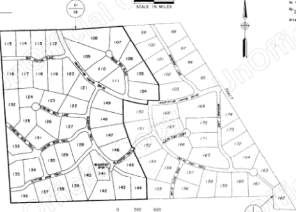
SCALE 1" = 300'

This subdivision is not within a designated Active Water Management Area. A preliminary water control plan has been prepared under the Arizona Department of Water Resources (Arizona R.W. 20-100) showing the water resources and easements for this subdivision.